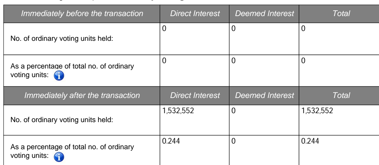
Table 1. Change in respect of ordinary voting units of Listed Issuer